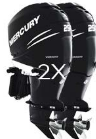
TWIN VERADO 250